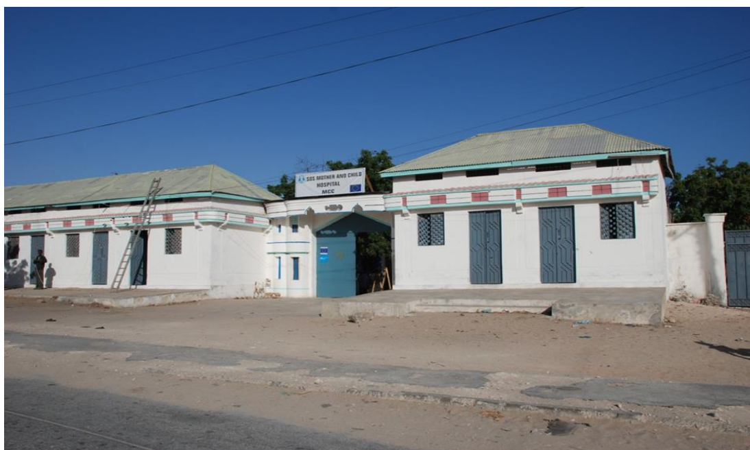
Mother-child clinic in one of Mogadishu's districts

Surgical procedures performed at Mogadishu hospitals include caesarean sections, treatment of gunshot wounds, hernias operations, appendectomies, and treatment of gastrointestinal disorders due to tuberculosis or intestinal parasites. In a conversation with Landinfo in Mogadishu in November 2013, UNHCR informed that it had become increasingly difficult for Somali citizens to obtain visas to Kenya for medical treatment. For instance, UNHCR described an incident in October 2013, when a child died because the family was not granted a visa to Kenya in time (interview in Mogadishu, 12 November 2013).