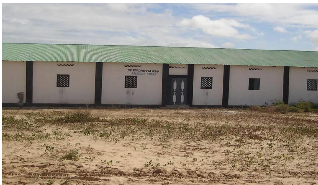
Daynile Hospital in the Daynile district of Mogadishu.

There are eight referral hospitals, ten regional hospitals and 26 district hospitals in South Somalia, but none of them can offer specialist services of significance. There are also 198 health centres / mother-child clinics providing basic services. Moreover, there are 269 health clinics intended to provide minimum services for the local population, but many of them are inoperative (Ministry of Human Development and Public Services. Directorate of Health n.d., p. 21).