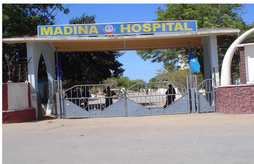
The Madina Hospital in the Madina district of Mogadishu.

Hospital standards vary. The Shifa hospital in Mogadishu, run by the Turkish organisation Doctors Worldwide Turkey, is considered to maintain a good standard. The same applies to the Zam Zam hospital, run by another Turkish aid organisation; Humanitarian Relief Foundation, IHH. Zam Zam performs cataract surgeries. The Digfer Hospital in Mogadishu, which was rehabilitated with Turkish aid, is scheduled to open in April 2015 (Republic of Turkey. Ministry of Foreign Affairs 2014). This is to be a modern hospital offering advanced treatment, but it will likely only be an option for those with the ability to pay (interview in Mogadishu 15 November 2013).